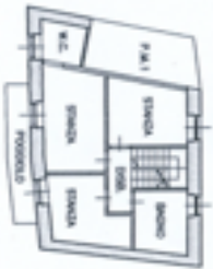
SECONDO PIANO H = 2.40 m.